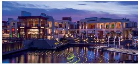
Cairo Festival City Mall