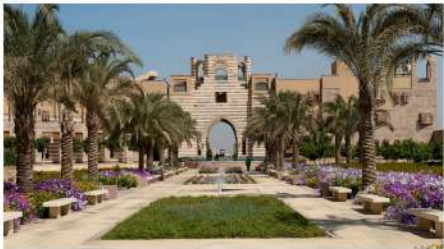
American University in Cairo