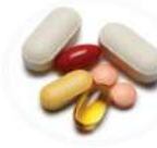
Vitamins & Minerals