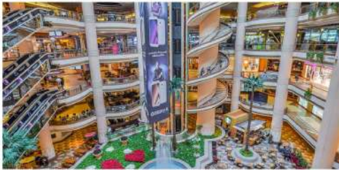
City Stars Mall