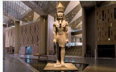
Egyptian Grand Museum