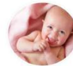
Infant Nutrition Products