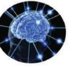
Nervous System Products