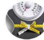
Weight Control Products